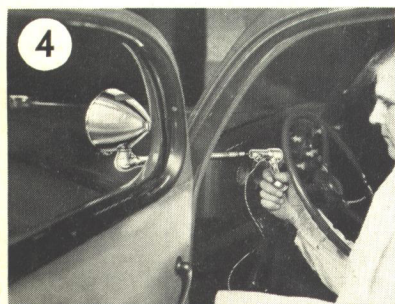
Press light through drilled hole—attach inside bracket, adjust frictions and the stop. Attach wire to ammeter. That's all there is to it!