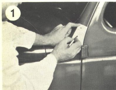
Position template enclosed with each bracket set in the manner shown above. Spot and drill two 1/8" holes.