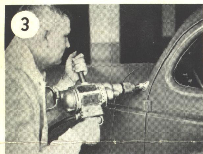
Put drill bushing in outside bracket and drill hole with 1/2" drill. The angle is pre-determined by bracket and drill bushing. Hold drill level.